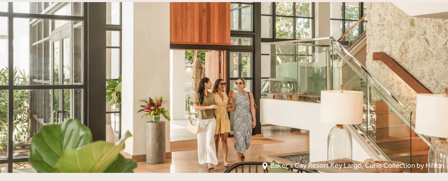
📍 Baker's Cay Resort Key Largo, Curio Collection by Hilton