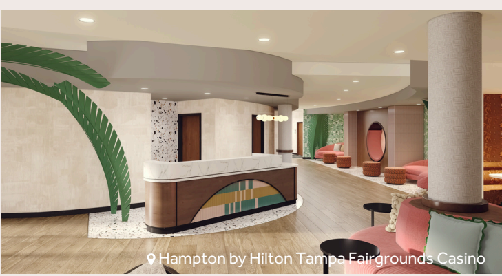
📍 Hampton by Hilton Tampa Fairgrounds Casino

Take a few moments to discover Hilton's featured properties in Hawaii. The Hawaiian Islands, a majestic archipelago in the Pacific Ocean, offer a variety of experiences for travelers. Comprising six main islands, each island offers its own distinctive characteristics and attractions.