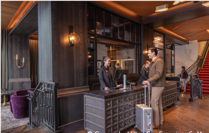
📍 Canopy by Hilton San Francisco SoMa

Hampton by Hilton invites you to join us for Discovery Days site inspections. Explore a selection of properties globally and experience firsthand what makes Hampton by Hilton unique.