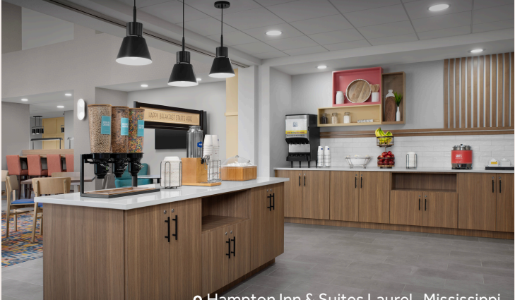
📍 Hampton Inn & Suites Laurel, Mississippi