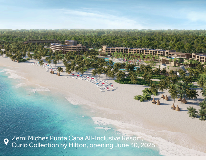
📍 Zemi Miches Punta Cana All-Inclusive Resort, Curio Collection by Hilton, opening June 30, 2025