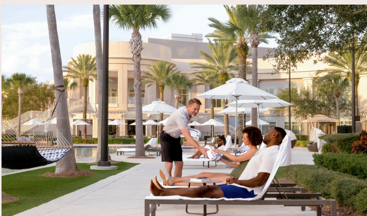
📍 Waldorf Astoria Orlando

Have you or a client had an exceptional experience at a hotel within the Hilton global portfolio? We'd love to hear your story how someone went above and beyond to spread the light and warmth of hospitality.