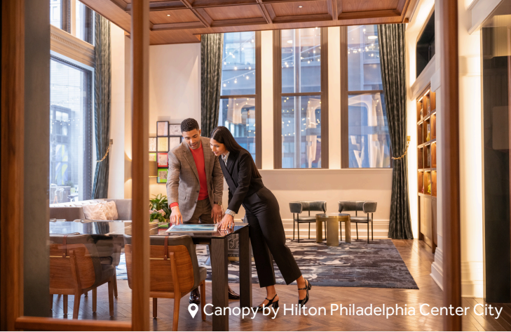
📍 Canopy by Hilton Philadelphia Center City