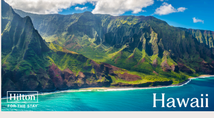
Hilton FOR THE STAY™ Hawaii