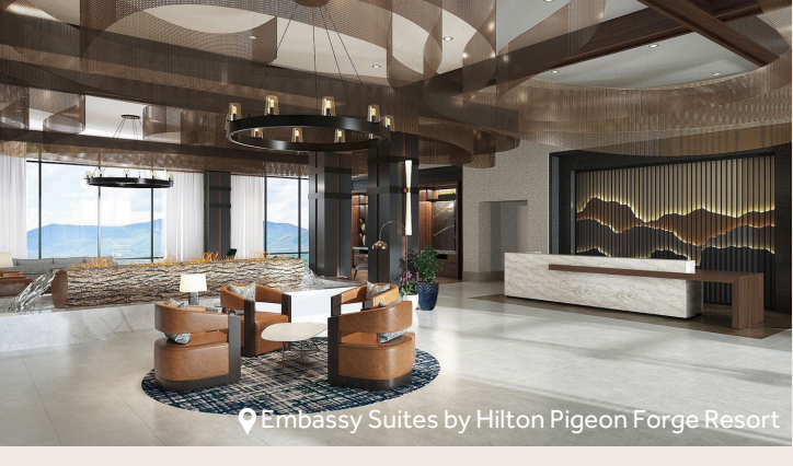
📍 Embassy Suites by Hilton Pigeon Forge Resort

Great news! Hilton is advancing the business travel industry as the world's first hotel group to automate the integration of virtual card payment details into its property management system. This technology, created in partnership with the leading virtual card technology provider Conferma, is now available at nearly all 8,600 properties worldwide.