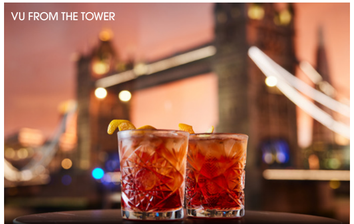
VU FROM THE TOWER