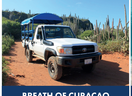
BREATH OF CURAÇAO